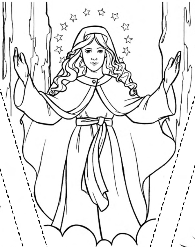
Our Lady of Champion (United States of America)