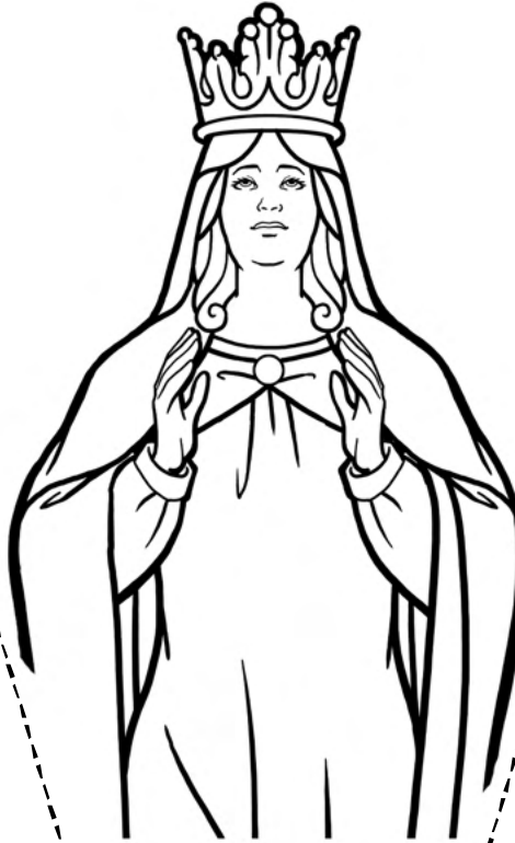
Our Lady of Knock (Ireland)