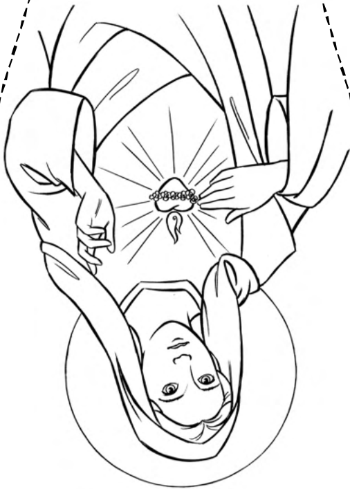
Immaculate Heart of Mary