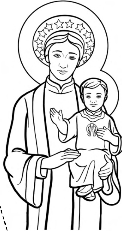
Our Lady of La Vang (Vietnam)