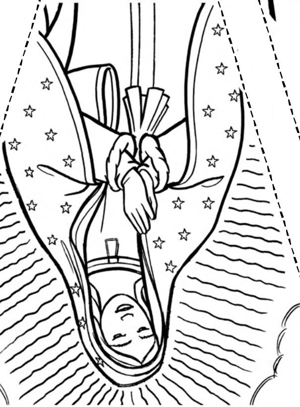
Our Lady of Guadalupe (Mexico)